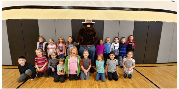
We met Smokey the Bear and learned about Fire Safety on Thursday. ☺

View the color photo and more photos in the online issue of our newsletter and on our school website at http://www.henrycountyr1.k12.mo.us/ .